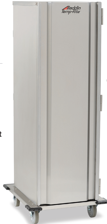
Model SC10E-525 Shown